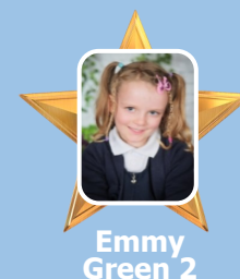
Emmy Green 2

Well done to Reception Green for 100% punctuality.