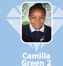
Camilla Green 2