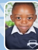
Leon Red 1